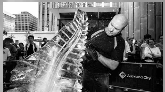
Carving up a storm with the finishing touches to an impressive ice sculpture.