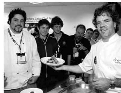
Yan Can Cook! Martin Yan shows his pizzazz with food as he takes delegates on 'A Wok through the Asian Kitchen'.