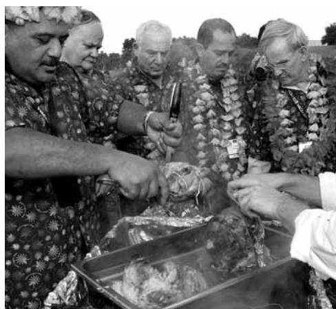
Lifting the hangi from the ground, and delegates enjoying the results as they dine in true Pacific style.