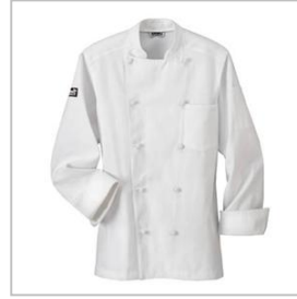
1.3. The Chef