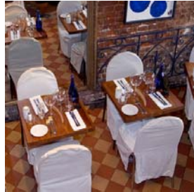
1.2. The Restaurant