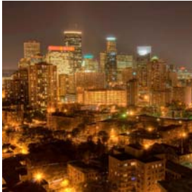
1.1. Select City