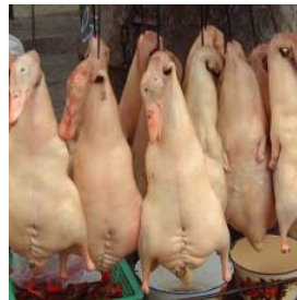
2.3. Meat or Fish