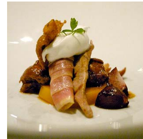
2.4. The Dish