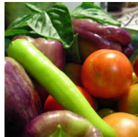
2.2. The Ingredients