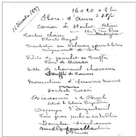
2.1. The Recipe